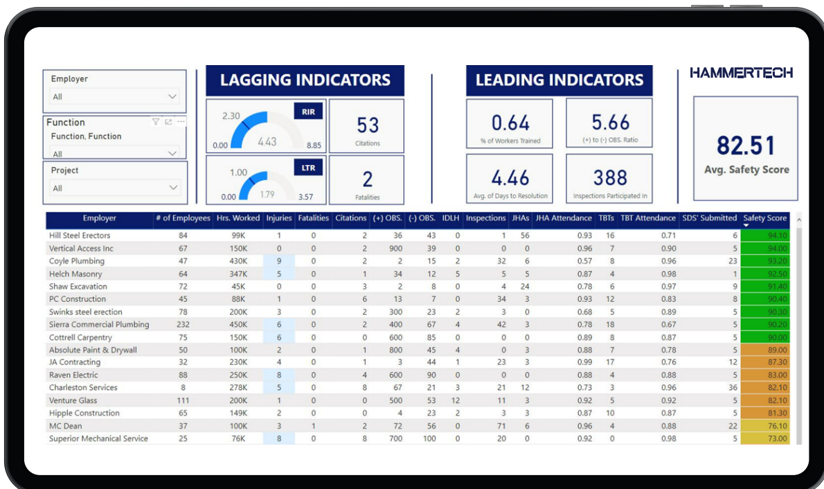
A trade performance dashboard can aide to visualize data and benchmark performance. Ideally it's populated with data directly from jobsites with an algorithm to rank based on metrics most important to your company.

With an established track record of performance, you can have confidence in your trade partners. This helps release your teams from the cycle of evaluating new partners from square one and the stress, uncertainty, and risk that come with it.